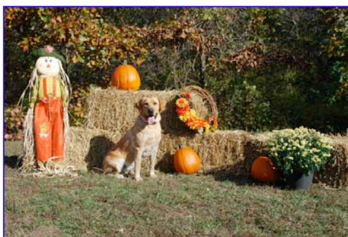
A lovely fall scene was the background for the Pet Photos booth.