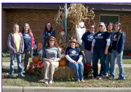
Students from Harrison College provided free nail trimming and micro-chipping.