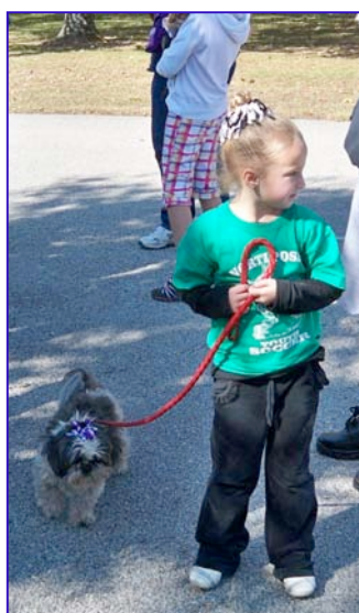
We had walkers of all ages and dogs of all sizes.