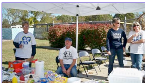
The food booth served up yummy hot dogs, hot chili and cold drinks.