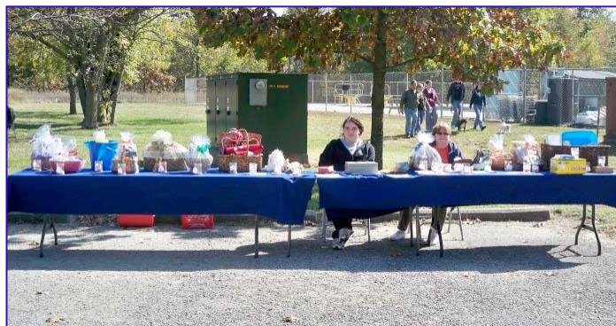
The silent raffle table was overflowing with items

Be sure to mark next years Tails & Trails on your calendar: October 20, 2012